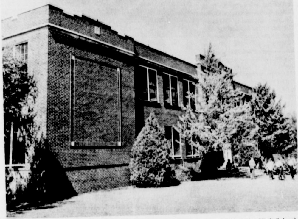
BUILT in 1925, many graduates have passed through the doors of the Matador High School. The last class, however received diplomas from the auditorium stage Monday night. Disposal of the structure has not been announced by the Motley County Independent School District board of trustees.