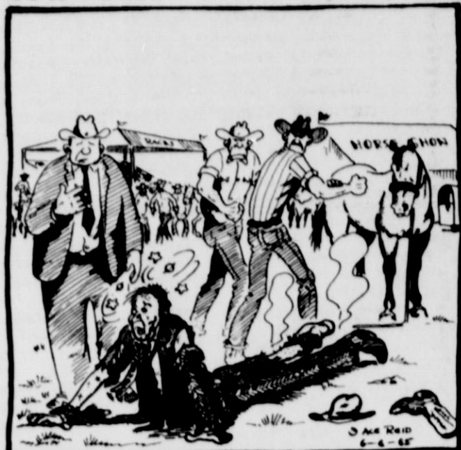
"Judge, seems like you ain't too popular any more!"