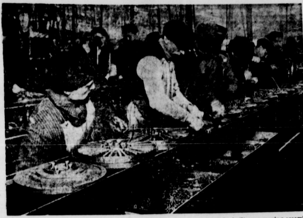
History was made as the flywheel magnet, first manufactured part to be built on a moving assembly line, passed by workmen at Ford Motor Company's Highland Park, Mich., plant in the spring of 1913. Time required to assemble magnet was reduced from 20 to five minutes; the principle was applied to all Model T assembly operations and mass production was born.