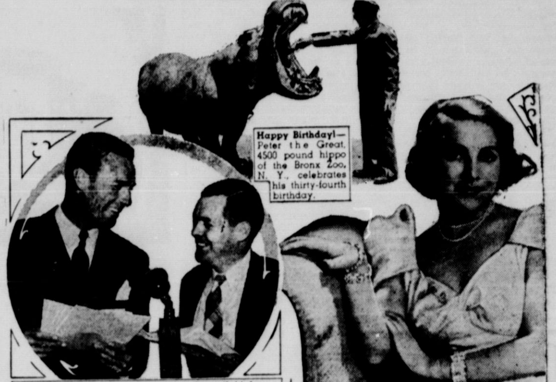
Happy Birthday! —Peter the Great, 4500 pound hippo of the Bronx Zoo, N. Y., celebrates his thirty-fourth birthday.