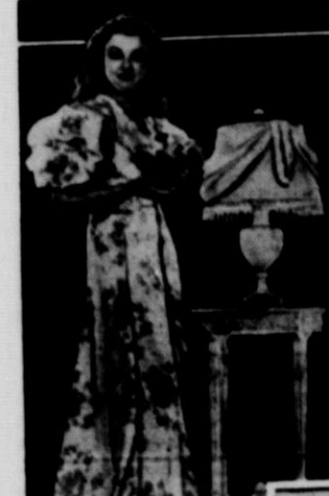
FEMINE NEGLIGEE —A lovely negligee worn by Jane Walsh, picture star, is made of heavy white crepe printed in a pastel floral design with orchid predominating. The full sleeves are shirred from shoulder to elbow and the shawl collar and streamer belt is of self-material.