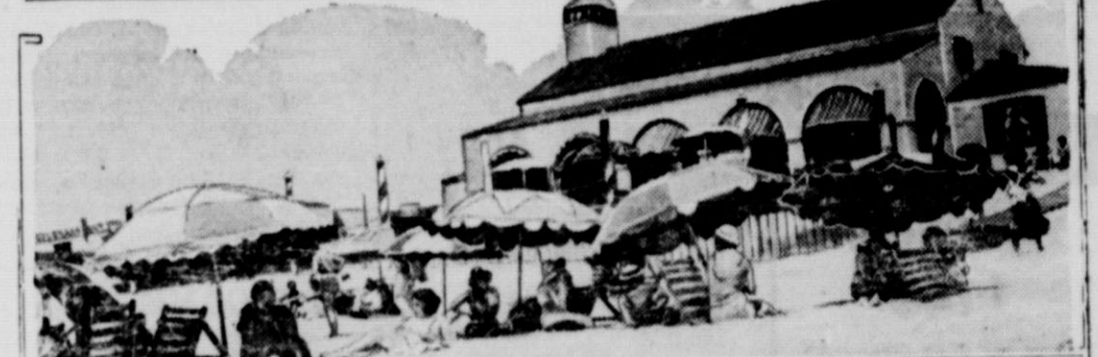
Where Beer Goes Top Hat —Exclusive resort of Society on Long Island, where beer has gone top hat and is being served at smart functions as a drink of moderation as well as a delightful beverage at meals.