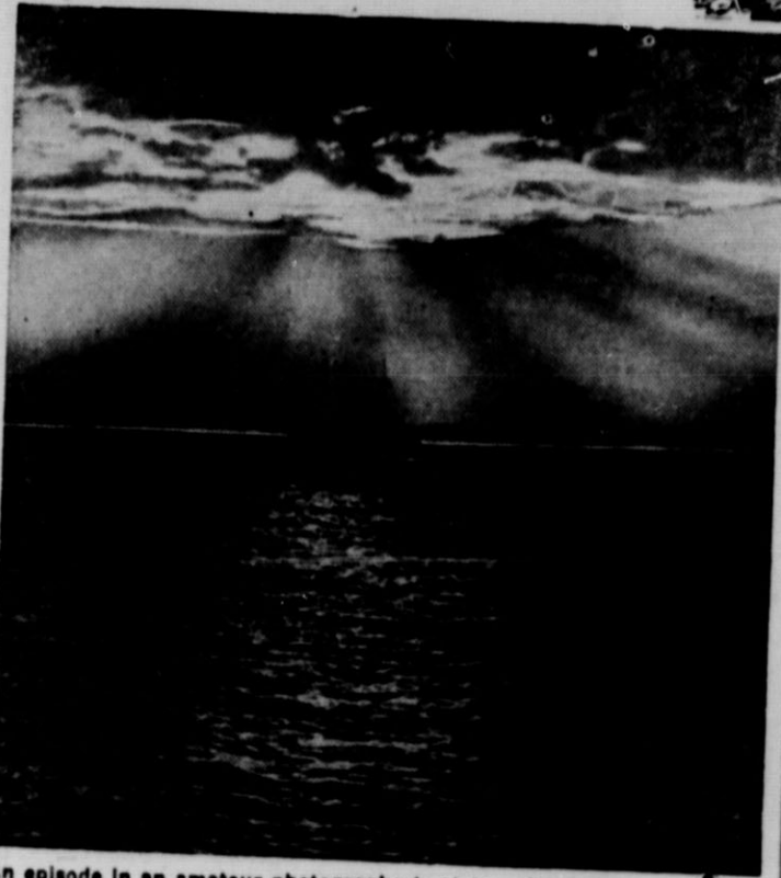
An episode in an amateur photographer's picture Odyssey of the travels of water. Exposure f.22 at 1/25 second.

THE moods of water, tumbling, bubbling, gushing, spouting, dashing, splashing, trickling, rolling, rippling, dripping, glad, angry, smooth, rough, serene peaceful, make adjectives for poets. For the amateur photographer with any poetry in his soul whatever, they make themes for beautiful pictures and the subject of a delightful picture hobby.