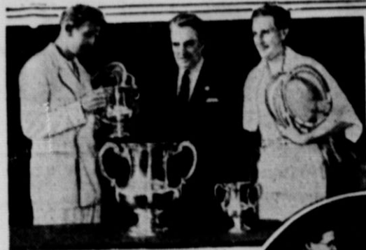
TO THE VICTOR —J. Donald Budge, another of those tennis wizards from California, receiving the trophy emblematic of the Men's National Singles Tennis Championship from Holcomb Ward, President of the American Lawn Tennis Association, as Gottfried Von Cramm, loser to Budge in the Finals at Forest Hills, L. I., smiles in defeat.

Those who love good music will hear it in 'One Hundred Men and a Girl' with Leopold Stokowski conducting the Philadelphia Orchestra and incidentally it will bring Deanna Durbin to the forefront of the young and beautiful