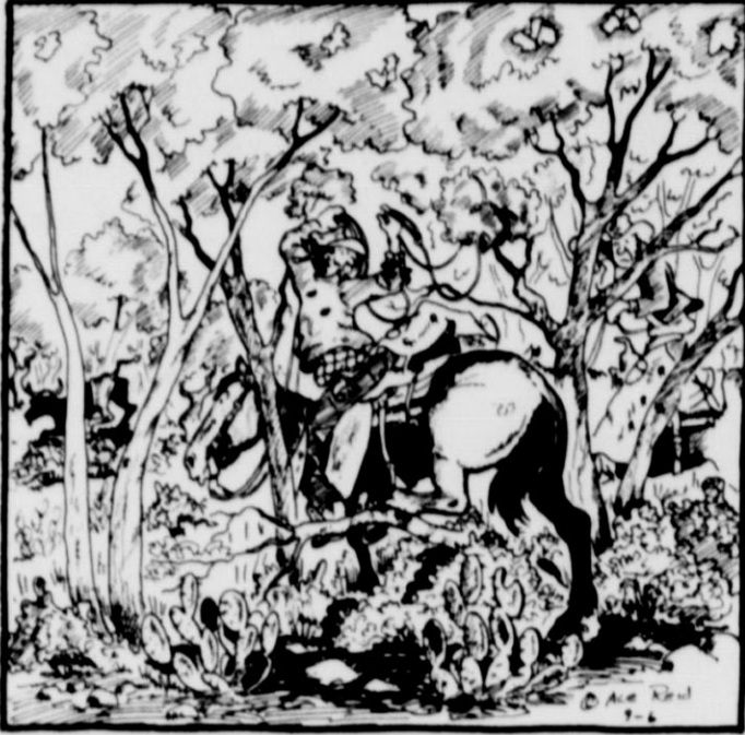
"At least we're gittin to work in the shade."

This feature sponsored by THE FIRST STATE BANK