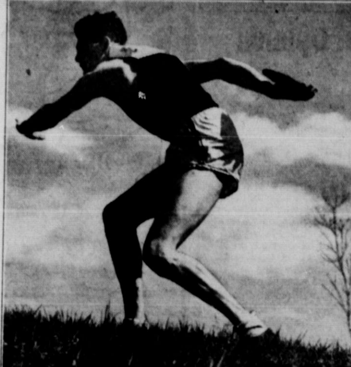
shutter speed. The athlete simply held still for a moment.

DRETTY soon the weather will | Any athlete, proud of his muscles be opening up, schools will start and uniform, should be glad to "hold it" a moment for you. And small