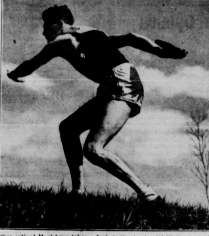
What action! Must have taken a fast shutter to stop it! Well, no-don't tell anybody, but it was snapped at 1/25 second, approximately box-camera

on their Spring athletic programs, small boys will be knocking battered baseballs around on vacant lots - and your youngster, very you want them to. likely, will be among them.