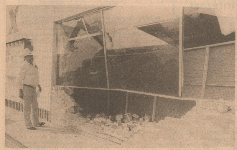
NOT AN ENTRANCE- Sheriff Alton Marshall surveys damage caused when a 1965 Chevrolet pickup rammed the front of the Matador Red X Travel Store Thursday afternoon. Although damage was heavy, there were no injuries to Melvin Moore, driver of the pickup, or to employees inside the store.