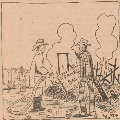
"Yeah, we have a number of suspects for burning Frank's down - half of the wives in town!"