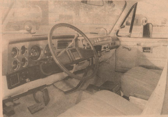
FROM THE INSIDE - A view of the new Motley County Ambulance shows the front panel of the vehicle. The public is invited to view the ambulance on Saturday, November 5 from 12 noon to 4 p.m.