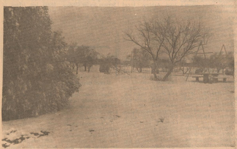
SPRING SNOW -- Residents in Motley County greeted another round of snow when they arose Tuesday morning. The late storm hit Monday, and by Tuesday morning enough snow had fallen to cover the ground. However by Tuesday evening the sun was again shining and most of the white stuff had melted.