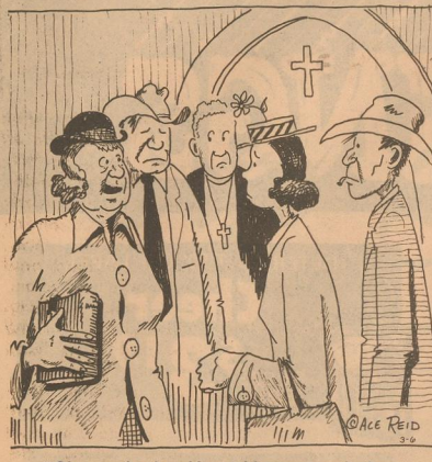
"Oh, your husband has told me so much about you... I hope someday to hear yore side!"