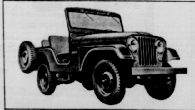
THE 'JEEP' UNIVERSAL —the most famous member of the 'Jeep' 4-wheel drive family of vehicles. It has three power take off points and a range of special equipment to suit all needs.