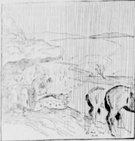
"If there don't see why somebody ain't invented a waterproof Bull Durham sack!"

This feature sponsored by THE FIRST STATE BANK