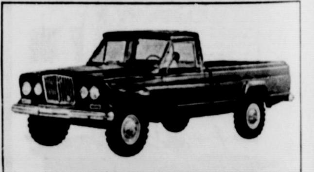
THE NEW 'JEEP' GLADIATOR —the first 4-WD truck to offer passenger car smoothness on the highway and sure-footed 'Jeep' traction off the road. It's available with GVW's up to 8600 lbs.