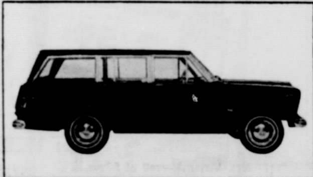
THE NEW 'JEEP' WAGONEER —the first real station wagon to offer the comfort, looks and performance of a passenger car PLUS 4-wheel drive traction and safety. 2-WD models also available.