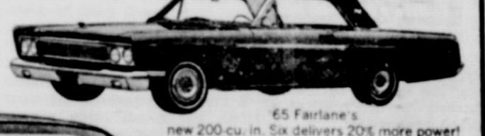
'65 Fairlane's new 200-cu. in. Six delivers 20% more power!