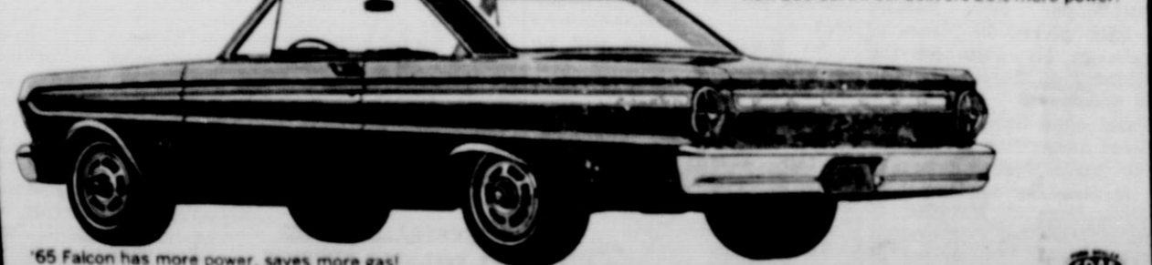
'65 Falcon has more power, saves more gas!

HURRY! HURRY! HURRY! LIMITED TIME ONLY! Matador Motor Company