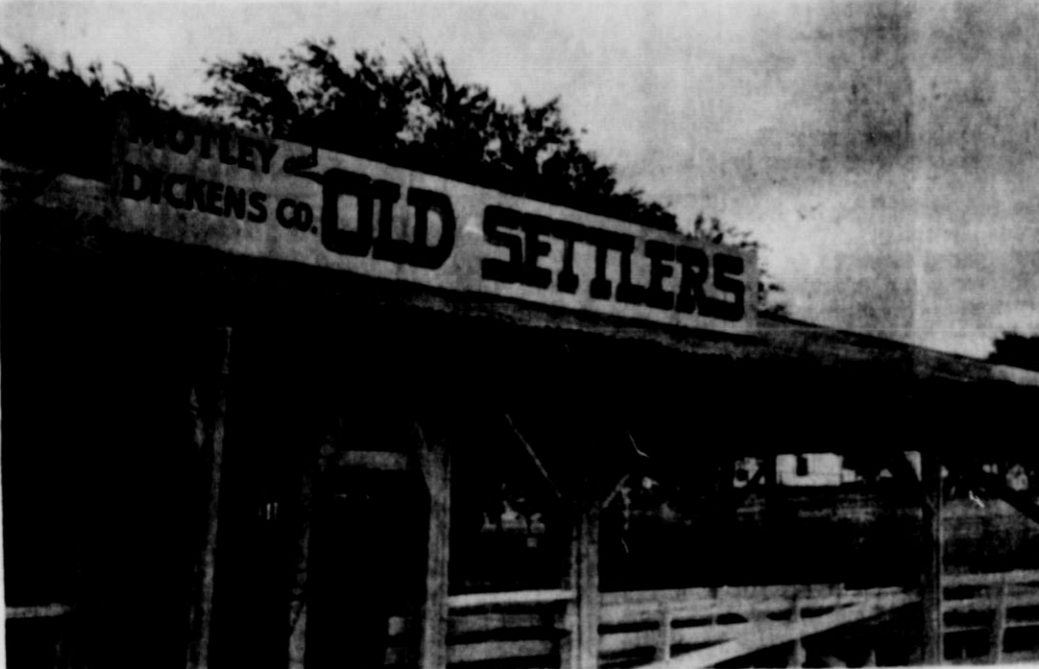
SCENE OF ACTIVITY—A week from today the above pavilion of Motley-Dickens Counties Old Settlers will be a scene of intense activity. For Thursday, August 27th is the first day of the 41st annual reunion. The celebration will continue through Saturday night, August 29th.