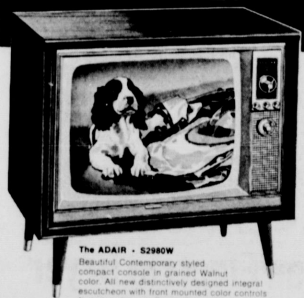
The ADAIR - 52980W

Beautiful Contemporary styled compact console in grained Walnut color. All new distinctively designed integral resescheon with front mounted color controls featuring the new Zenith Color Commander Control. 5" x 3" Twin-cone speaker.