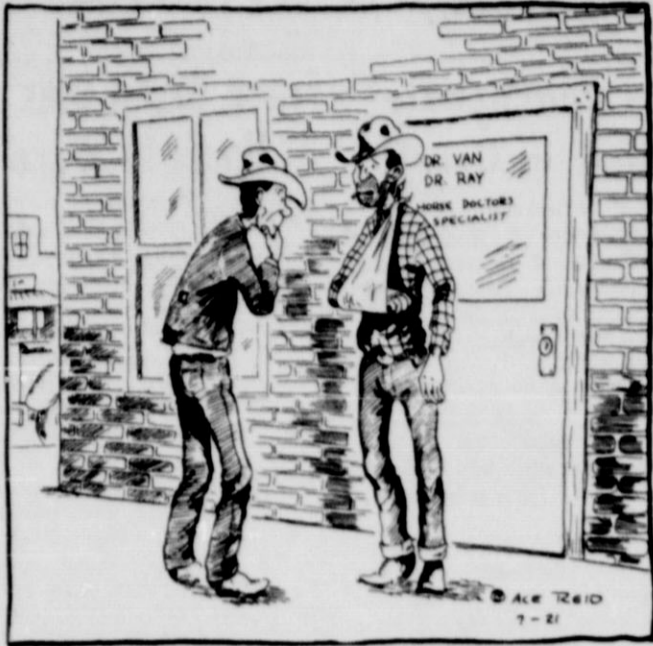
"The banker broke it. He was a little anxious for that cattle check I jist got."

This feature sponsored by THE FIRST STATE BANK