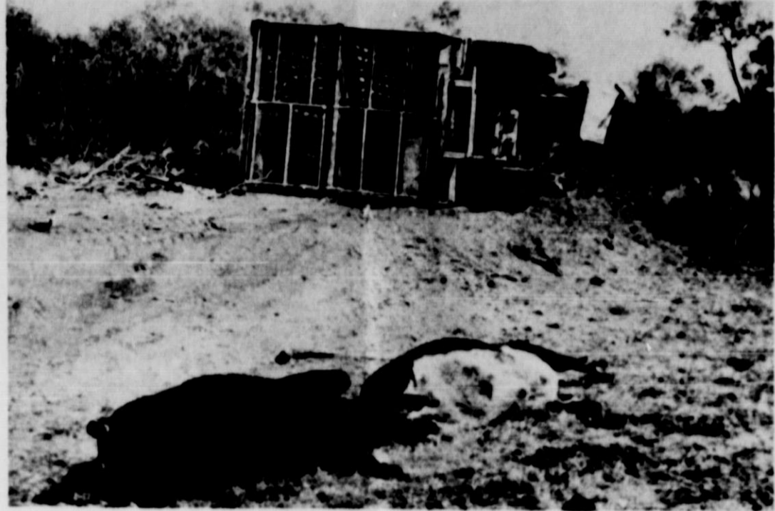
TWO dead steers killed when the load trailer truck plowed into the mesquites on US Highway 70 west of town Saturday. Balance of the 41 head escaped.

The accident, the second on the same curve within 60 hours, on US Highway 70, was reported at 11 p.m. The truck, heavily loaded with potatoes from Hart, Texas, skidded on its side 425 feet before bursting into flames, according to Highway Patrolmen Ira Kuhlman and Neal Haroldson, and Sheriff J. D. Spray, who investigated the wreck.