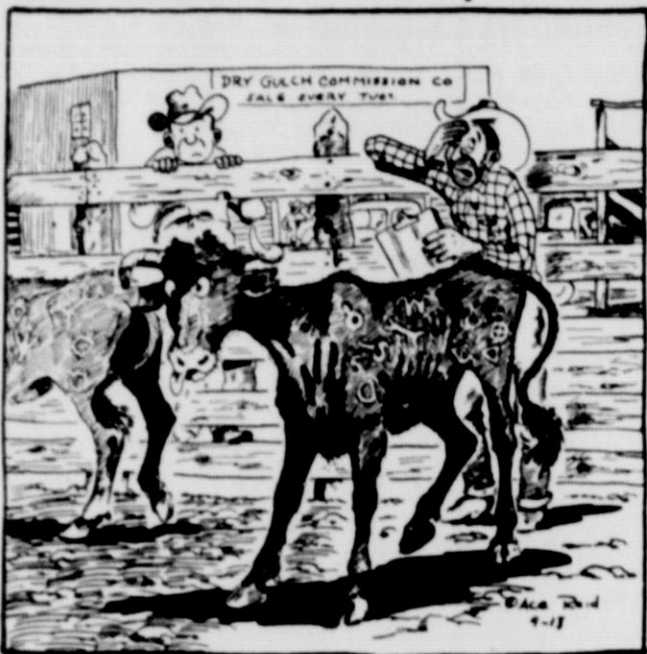
"300 of these—and I wanted to be a brand inspector!"

This feature sponsored by THE FIRST STATE BANK