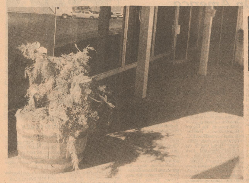
YELLOW RIBBONS FOR RELEASED HOSTAGES -- Matador did it's part in welcoming home the freed hostages Sunday. Matador Variety store had yellow ribbons tied in front of the store on the small tree and Our Lady of Guadalupe Catholic Church pealed the church bells 444 times on touch down of Freedom One, the plane carrying the former hostages, at Stewart Air Base Sunday.