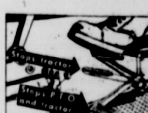
LIVE POWER TAKE-OFF* Two-stage power controls both tractor and PTO clutch. *Standard on Models 600 and 660.