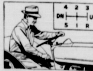
5-SPEED TRANSMISSION gives wide range of speeds for best work, efficient engine operation.* *Optional on all except 600 Model. *Sold separately.