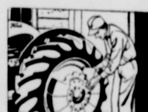
WEIGHT TO SUIT THE JOB—Sectional wheel weights can be added as you need them.* *Sold separately.