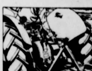
ADJUSTABLE TOP LINK lets you adjust implements for best work, from the tractor seat.