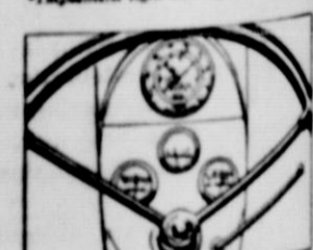
FAMOUS PROOF-METER helps you get top performance from your tractor. Easy to read.