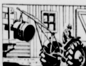
MORE HYDRAULIC POWER, TOO! for handling work loads easier, controlling heavier tools.