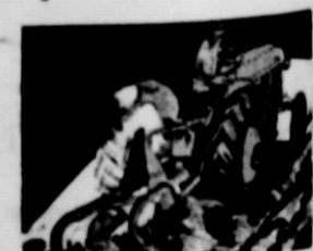
LIGHTS ARE STANDARD—perfect night work, safe road travel. Headlights, tail light only. *Optional light and horn.