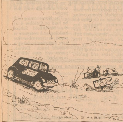
"Now that you have bought this place... ever nite you can sing 'Where the deer and the rattlesnakes play!'"

This Feature Sponsored By First State Bank