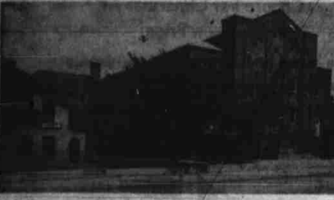
"Preventive Religion." Religious moving picture at 4 p. m. Evangelistic sermon.