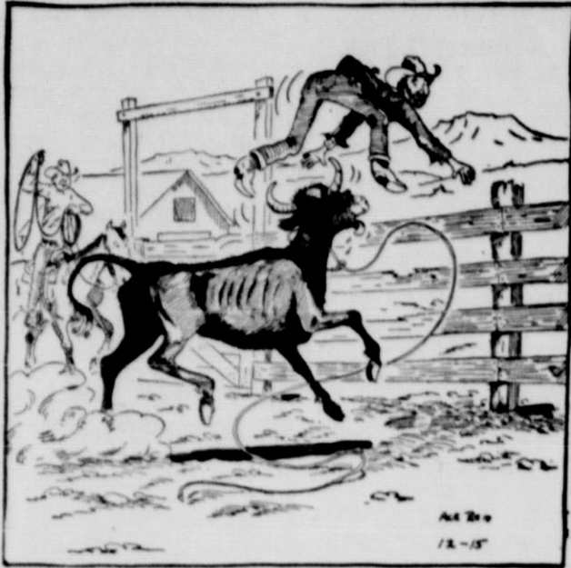
"Oh me, these old critters seem to know I'm gettin' slower every year."

This feature sponsored by THE FIRST STATE BANK