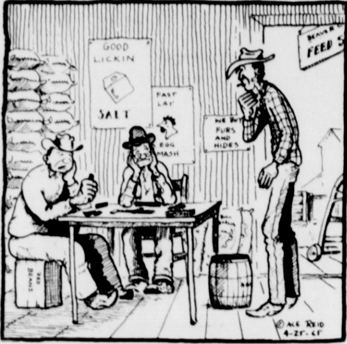
"Naw, we ain't upset about world affairs, somebody stole our double six!"

This feature sponsored by THE FIRST STATE BANK