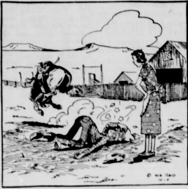
"Wul, now whose gonna get the grass stains outa them pants?"

This feature sponsored by THE FIRST STATE BANK