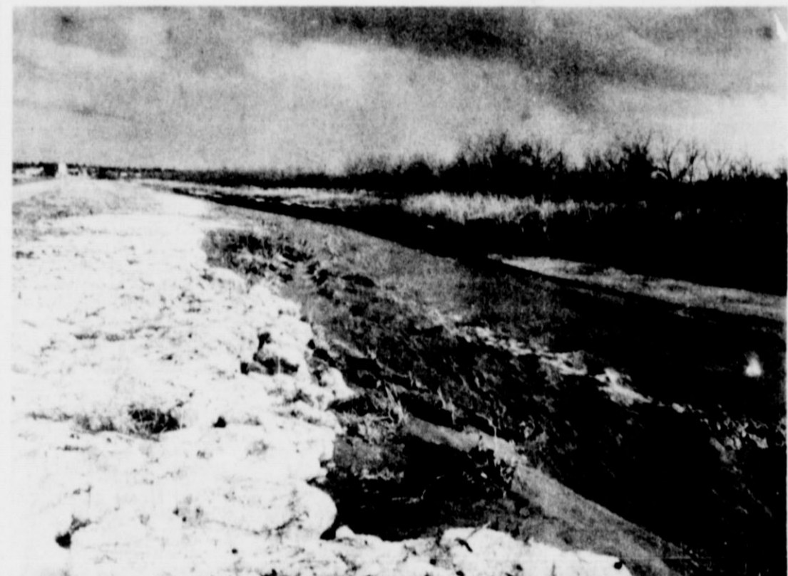
ICE SCENE along State Highway 70 just northwest of town. The hail was 24 inches thick in this area and photo was made over an hour after the passage of the storm Friday. Flooded borrow ditch is seen at right. Matador may be seen in extreme left corner.