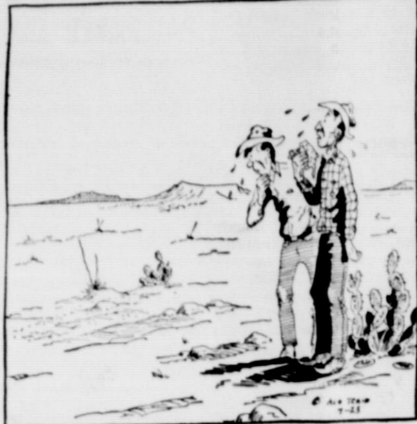
"Sometimes it seems all that ever grows on our place is the overhead."

This feature sponsored by THE FIRST STATE BANK