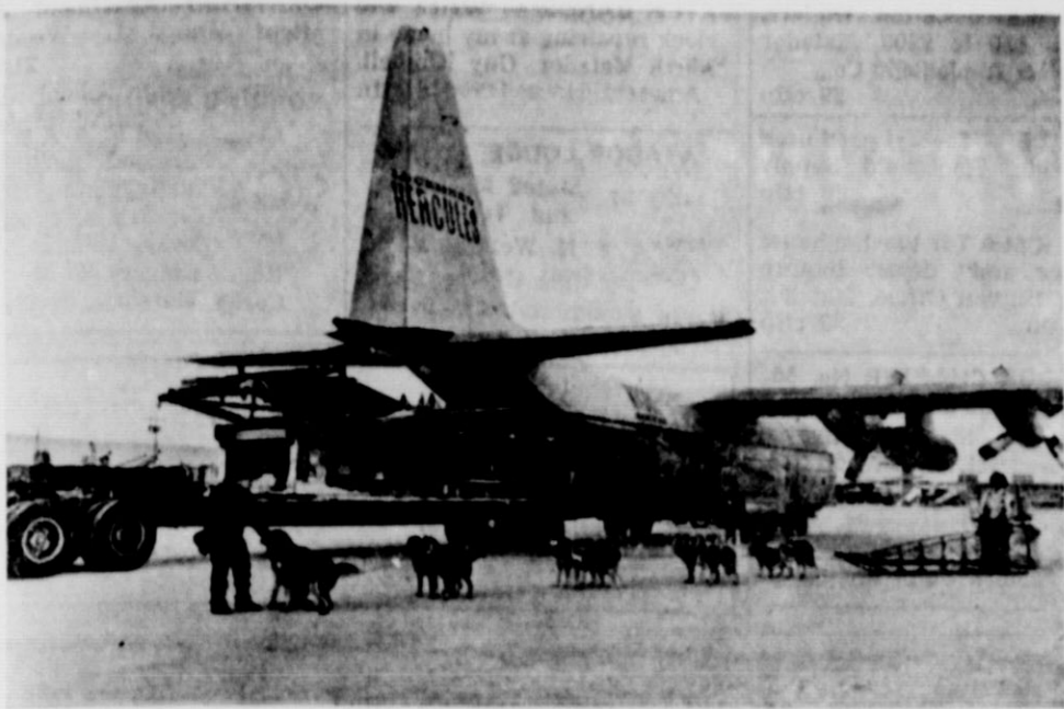
ARCTIC AIRLIFT—Nearly three million pounds of oil drilling equipment have been air-freighted from Fairbanks, Alaska, to a wildcat drilling site on the Arctic Slope. The 21-day airlift was carried out by Humble Oil & Refining Company and Atlantic Refining Company. The two companies will drill for oil on a site 330 miles north of Fairbanks, where temperatures as low as 50 degrees below zero were encountered by the airlift crews. Above, on a frozen runway at Fairbanks, a native sled and dog team stand by as a section of drilling rig is loaded into the cargo aircraft.