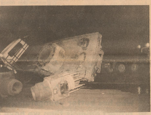
second truck was used to pull the wrecked truck back upon its