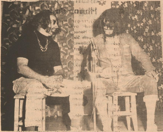
WHAT IS THE STORY behind this picture? If you know, send a letter to the Matador Tribune, Box 490, Matador, Texas 79244. The Tribune has many pictures which may be picked up by the public. Come by and look through them.