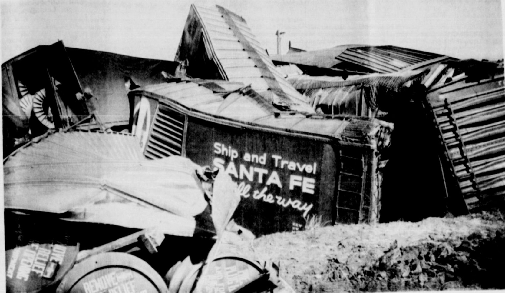
ABOVE SCENE was made at the wreck of the QA&P freight train at Russelville Switch on Sunday evening, October 24, in which 31 cars were derailed.