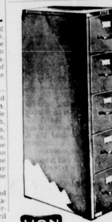
HON MATADOR TRIBUNE 1001 MAIN STREET TELEPHONE 347-2400

are interested in knowing the value of the feed you are testing, why not submit a sample for test. Cost for protein analysis is $1, and this test will probably tell why you have good looking grass or feed, and the cattle aren't eating it.