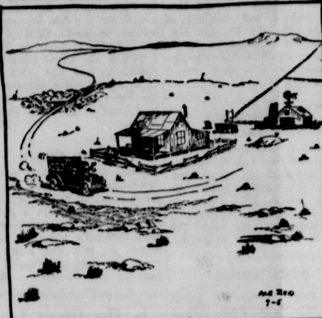
"The best thing about our glamorous little ranch, we ain't bothered much by mildew or kinfolks."

This feature sponsored by THE FIRST STATE BANK