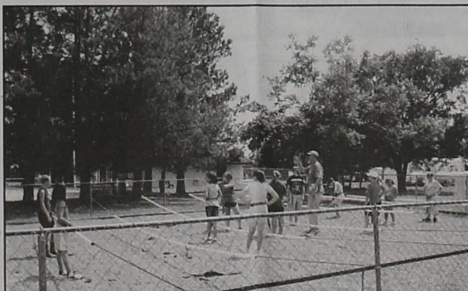
4-H members playing Foosball County Camp.