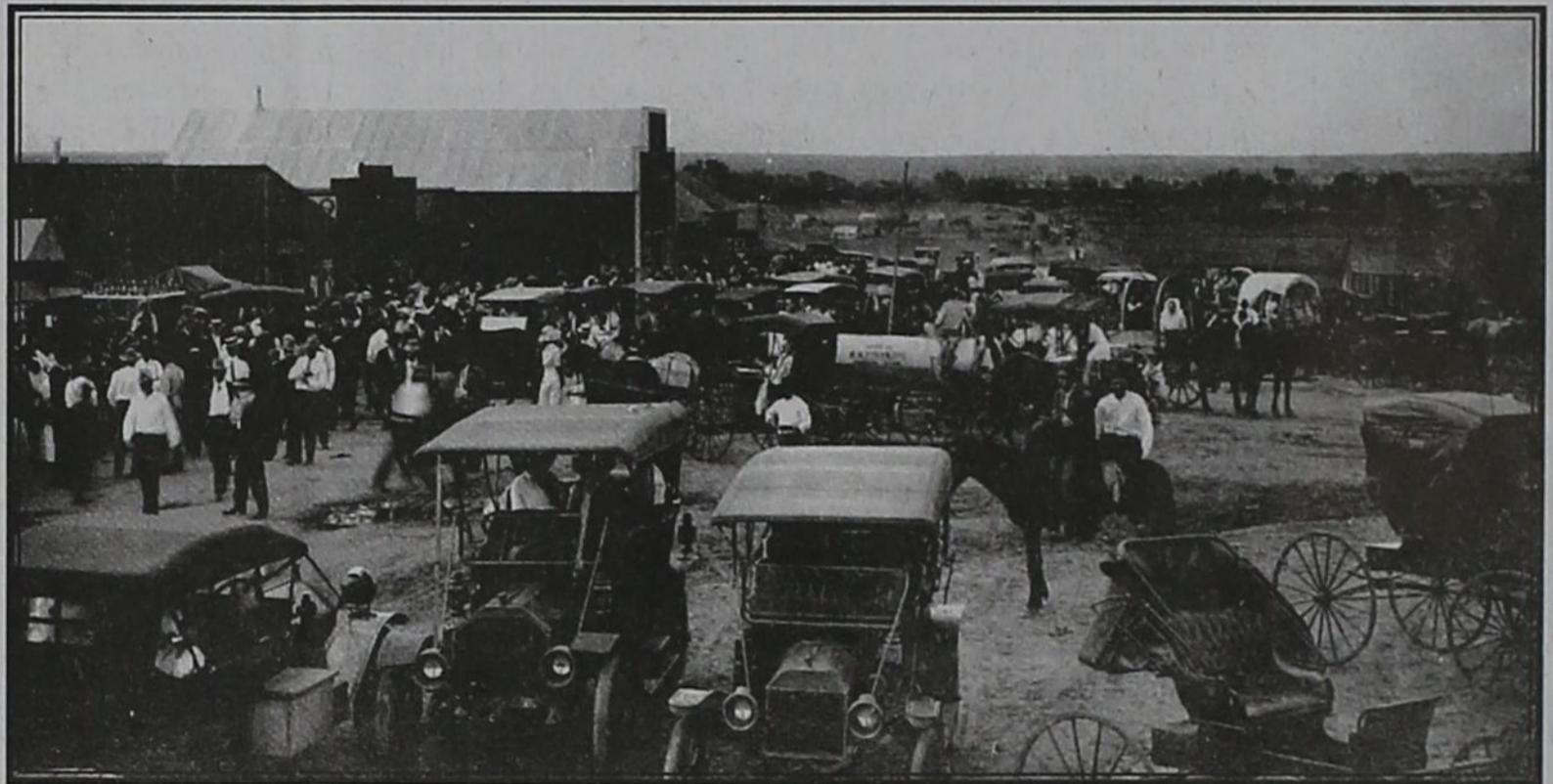
This historical photograph is of Opening Day in Roaring Springs when the city was platted and organized. Sheriff Henry Black served as the townsite agent.

Tear sheet $2 and publisher's affidavit: additional $3 Scanned documents additional $5 Obituary: $25 minimum, with photo, additional $5 Thank you notes: $13 minimum Birth and Wedding Announcements: $25 minimum, with photos additional $5 Classified: $6 1st four lines paid in advance, $7 billed