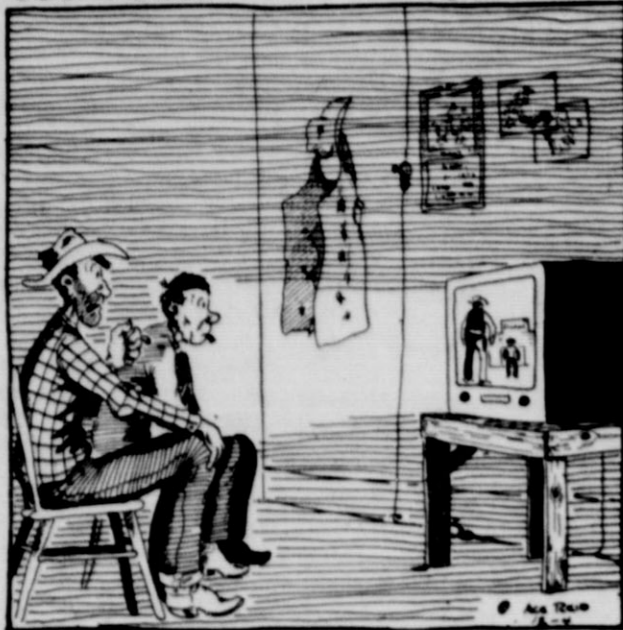
"I just wonder if Matt Dillon is that calm when he's facing his mean ole banker."

This feature sponsored by THE FIRST STATE BANK