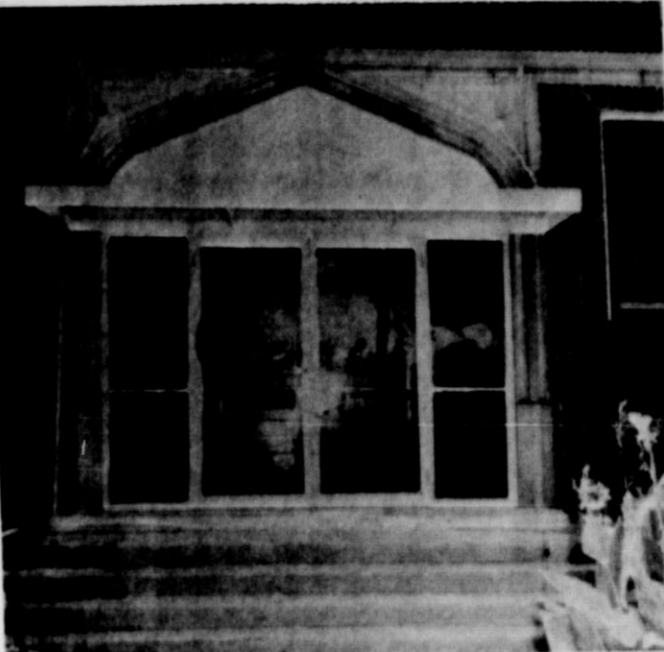
THROUGH THESE PORTALS—New glass doors which have been installed in Matador High School building, adding much to the appearance of the structure. Modern new doors have also been installed at the grade school building. Both buildings are in excellent repair, and the school campus has the appearance of a beautiful park.