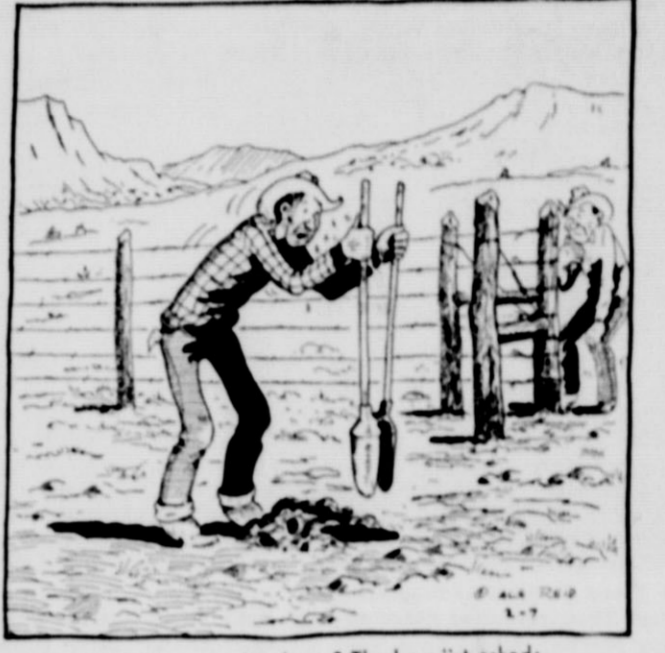
This feature sponsored by THE FIRST STATE BANK