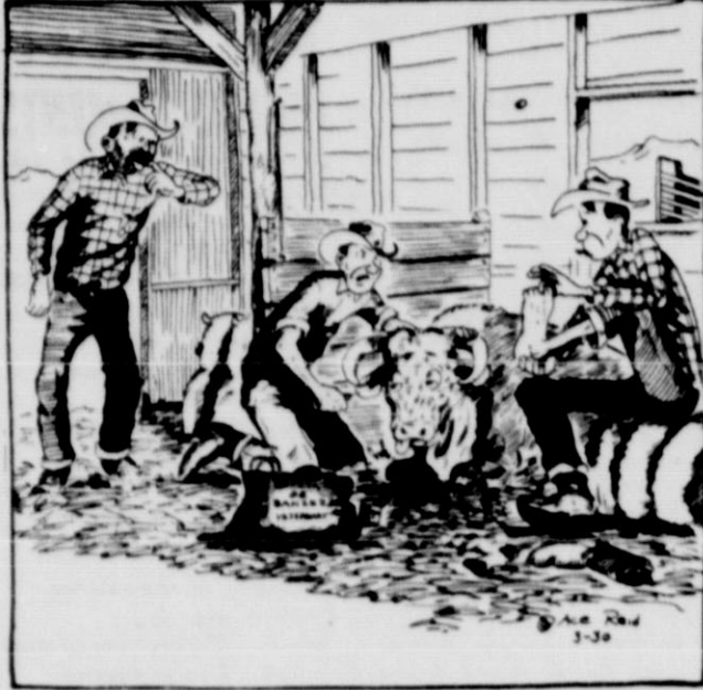
"No, you block heads, I'm out here to doctor this ole bull—not every dang hand on the place."

This feature sponsored by THE FIRST STATE BANK