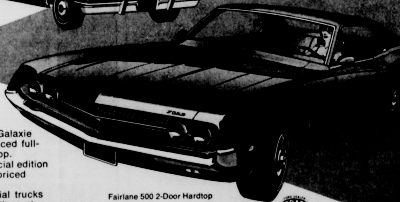
Fairlane 500 2-Door Hardtop

Special Ford Galaxie 500, lowest priced full-size V-8 hardtop. Torino... special edition of our lowest priced hardtop. Explorer Special trucks with luxury options at savings up to $197*.