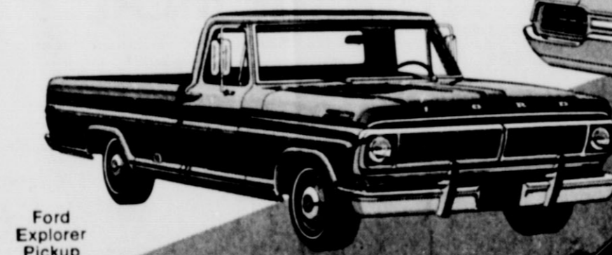
Ford Explorer Pickup

The facts favor Ford! Ford Galaxie 500's, Torinos, Ford Explorer Special Pickups. Special editions at reduced prices. Limited time sale.