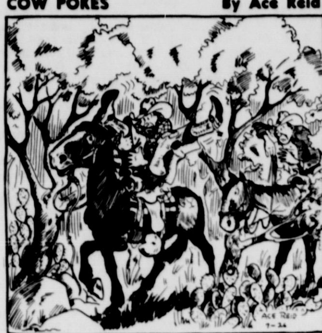
'I shore ain't showing off! A snake jist fell outta that tree right into my leggins!"

This feature sponsored by THE FIRST STATE BANK