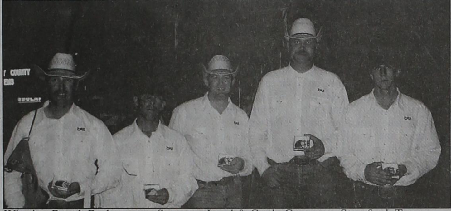
Winning Ranch Rodeo team: Swenson Land & Cattle Company, Stamford, Texas