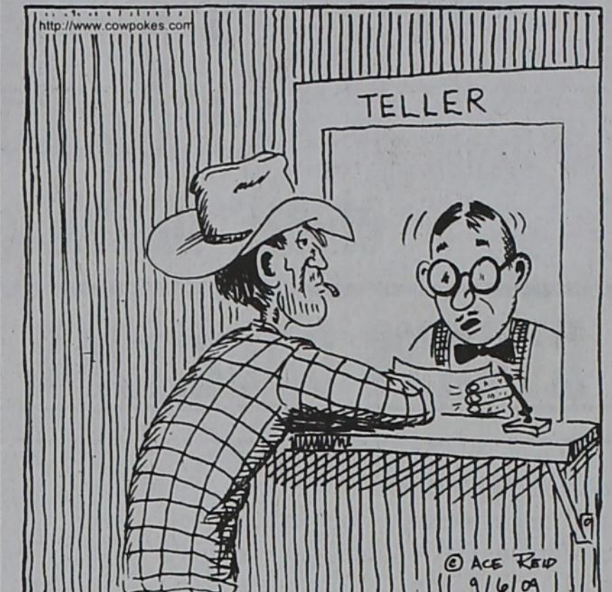
"Yeah Jake I'd like to accept yore check...but the bank wouldn't!"