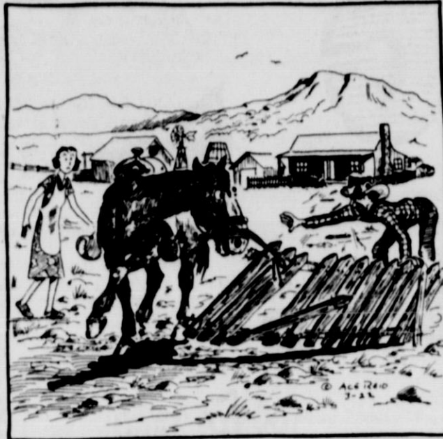
"Aw quit nagin' at me Maw! I wuz gonna build a new fence anyhow!"

This feature sponsored by THE FIRST STATE BANK