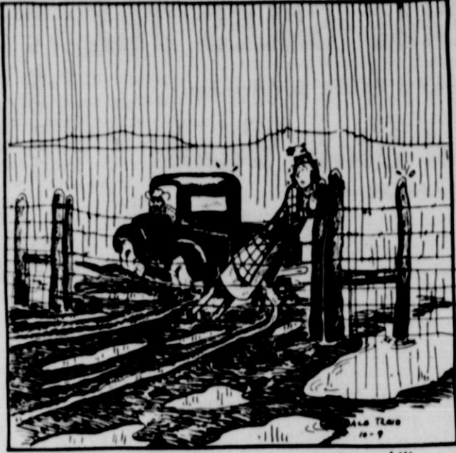
"Hurry up, Maw, or we're gonna git stuck!"

This feature sponsored by THE FIRST STATE BANK