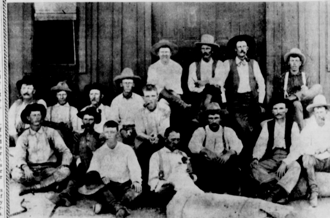
SPUR RANCH COWBOYS in 1894

Congratulations To the Pioneers ... And Our Gratitude to Those Whose Sacrifices Followed their Faith!