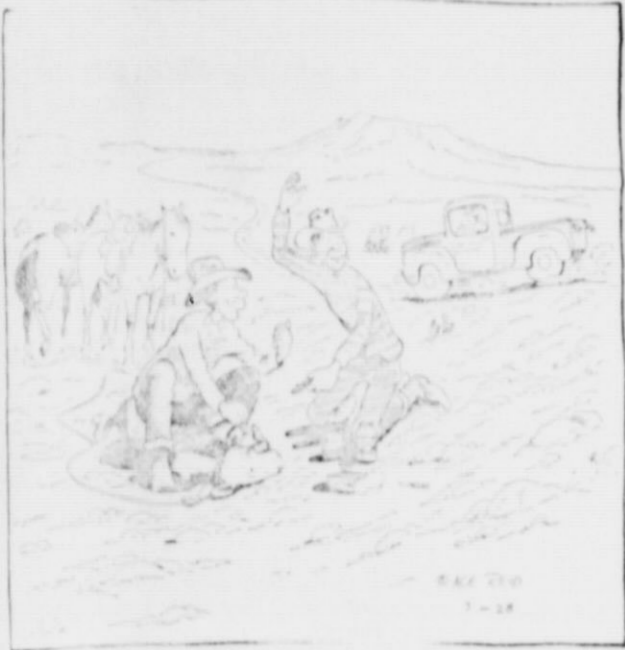
"Don't get too friendly with that veterinarian. If he steps, it'll cost us $3.00."

This feature sponsored by THE FIRST STATE BANK