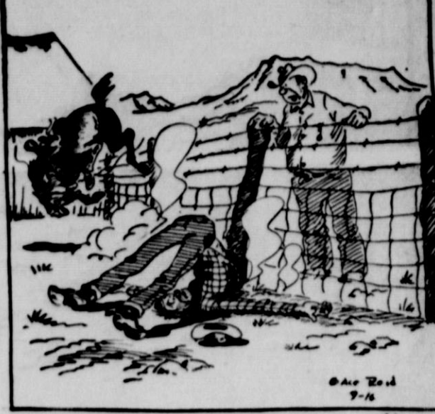
now you're gonna have to re-set this pos and re-stretch the wire!

This feature sponsored by THE FIRST STATE BANK