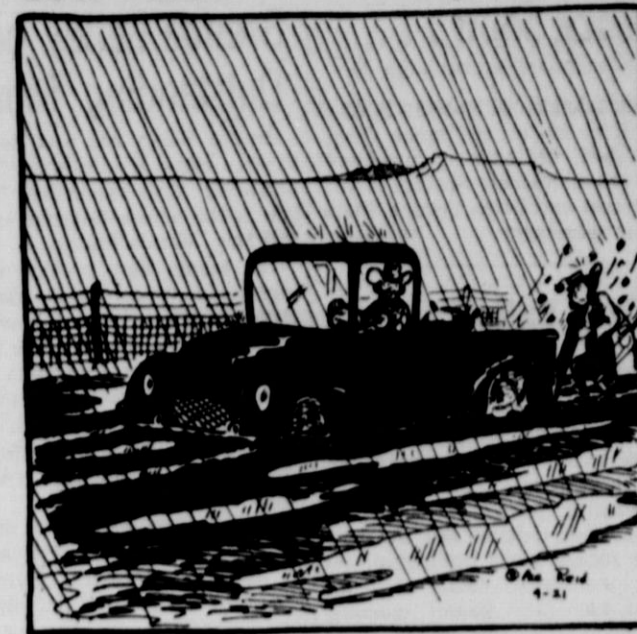
But Ma, I got on my new boots!"

This feature sponsored by THE FIRST STATE BANK