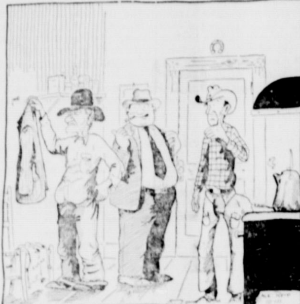
Your cook's miserable disposition just got him elected President of the bank!

This feature sponsored by THE FIRST STATE BANK