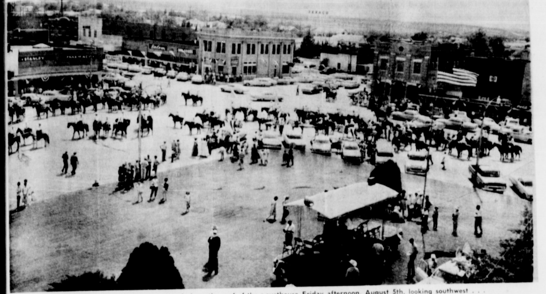
CAN YOU FIND YOURSELF in this photo? It was made from the roof of the courthouse Friday afternoon, August 5th, looking southwest.