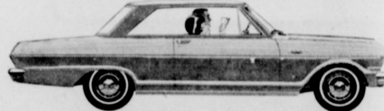
'64 Chevy II Nova Sport Coupe (110-in. wheelbase)