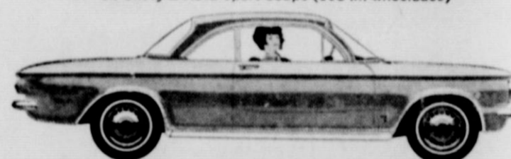
'64 Corvair Monza Club Coupe (108-in. wheelbase)