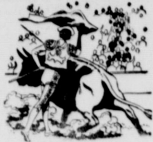
OFFICIAL PUBLICATION MATADOR SCHOOLS