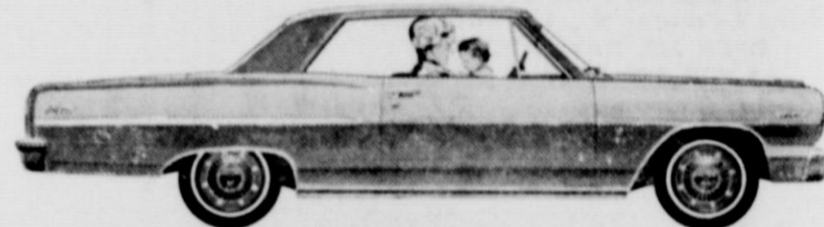
New Chevelle Malibu Sport Coupe (115-in. wheelbase)