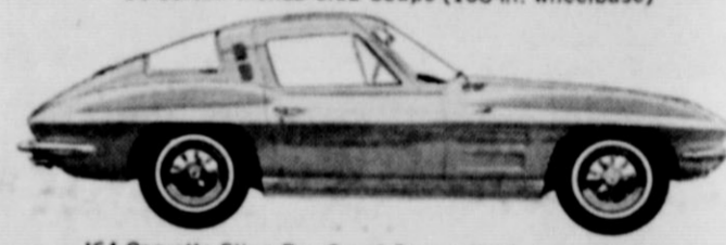
'64 Corvette Sting Ray Sport Coupe (98-in. wheelbase)