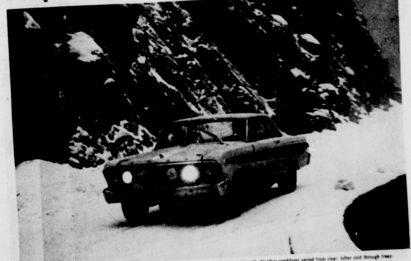
Four Falcons started from Oslo, four from Paris, on routes calculated to be equal in difficulty and length. Weather conditions varied from clear, bitter cold through freezing fog to blinding snow—and the time schedules made no provision for delays. Here a Falcon swirls through a sudden snow shower, testing traction in a practice run.

Falcon entered two classes in Europe's 2,700-mile winter ordeal—won them both and finished 2nd overall out of 299 cars. That's durability!