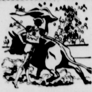
OFFICIAL PUBLICATION MATADOR SCHOOLS