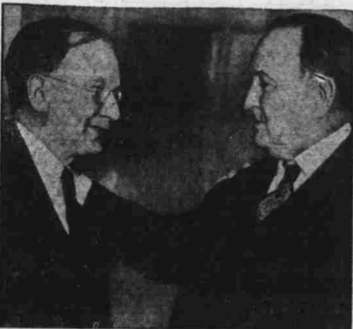
Senator Robinson of Arkansas (right) interrupted a speech by Senator Wheeler of Montana following the supreme court decisions on the railway labor act and other issues to declare the court had "completely-reversed itself." "I assume the senator is delighted," retorted Wheeler. Here they are after the exchange, however, chatting.