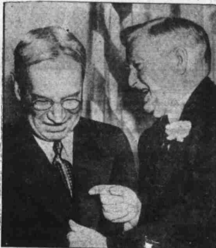
Perhaps it's a pleasant prediction for the future, or maybe they're recalling "way back when"—as Vice President Garner (left), congratulates Senator Hiram Johnson on his 20 years of service in the senate.