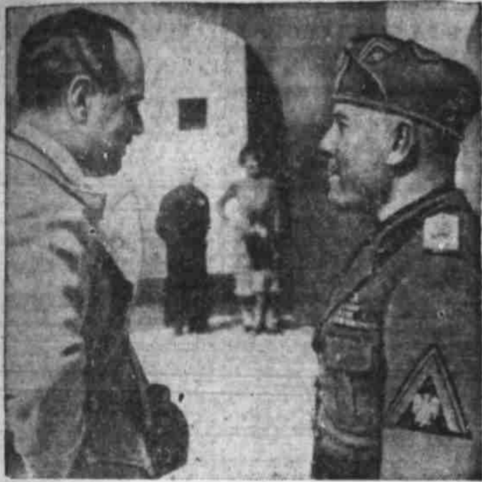
While Mussolini was talking with Ward Price, British newspaperman in Tauorga, Libya, the photographer caught this unusual picture of Il Duce.