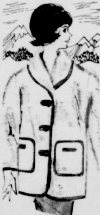
FASHION'S NEW "NORTHERN LIGHT"

Snug as a bear hug, that's our fabulous Eskimo coat! Sporty young look in acrylic pile Yak Cloth, outlined in suede. Pockets almost big enough to carry a papoose! Deepshaw collar is flattery personified. Craftsman-tailored by Betty Rose in sparkling White Mist, sizes 6-16.