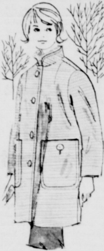
GOING AROUND IN THE BEST CIRCLES!

'Round and 'round goes the corduroy weave—and 'round the clock goes this handsome coat! Shorter than long, longer than short—and long on good looks. Lined with cozy acrylic pile and dashed with mouton processed lamb* inside the collar. Mammoth pockets! Suburban Cord in luscious colors: Fleece, Hemp, Antelope, Blue, Red, Black. Sizes 6-16.