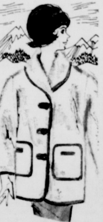
FASHION'S NEW "NORTHERN LIGHT"

Snug as a bear hug, that's our fabulous Eskimo coat! Sporty young look in acrylic pile Yak Cloth, outlined in suede. Pockets almost big enough to carry a papoose! Deep shawl collar is flattery personified. Craftsman-tailored by Betty Rose in sparkling White Mist, sizes 6-16.