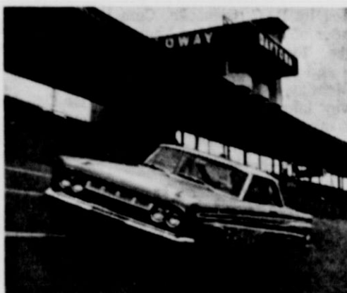
On Sept. 21, we set out to test the stamina and rugged construction of a specially equipped and prepared team of 1964 Comets at Daytona, Fla.