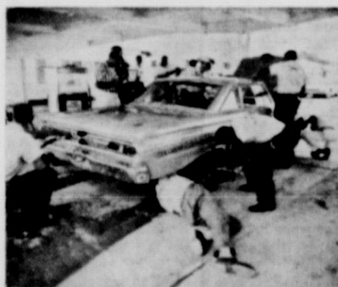
These Comets drove day and night for 100,000 miles. Average speed of the lead car—over 105 mph—includes time for refueling and maintenance.

Comet Durability Run: toughest challenge of automotive stamina ever faced!