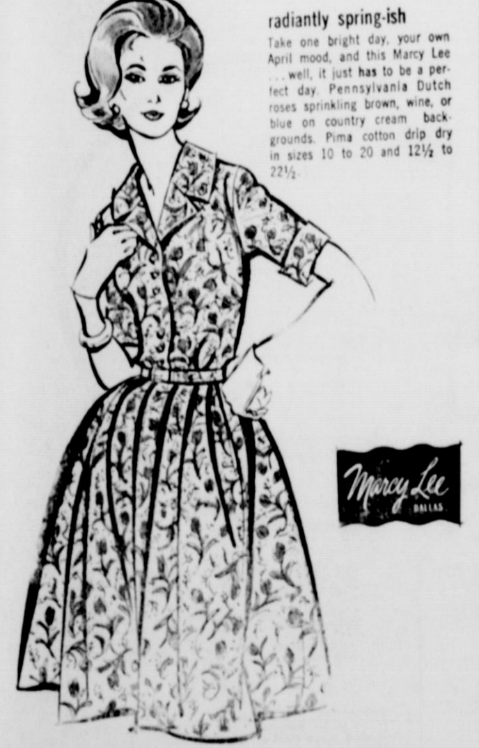
radiantly spring-ish Take one bright day, your own April mood, and this Marcy Lee dress, well, it just has to be a perfect day. Pennsylvania Dutch roses sprinking brown, wine, or blue on country cream backgrounds. Pima cotton drip dry in sizes 10 to 20 and 12 1/2 to 22 1/2.

This beautiful Marcy Lee dress received just in time - for right this minute . . . for into spring . . . many other new arrivals awaiting your selection!