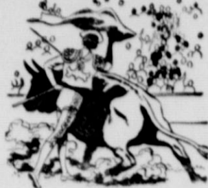
OFFICIAL PUBLICATION MATADOR SCHOOLS