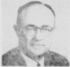
Working for Texas