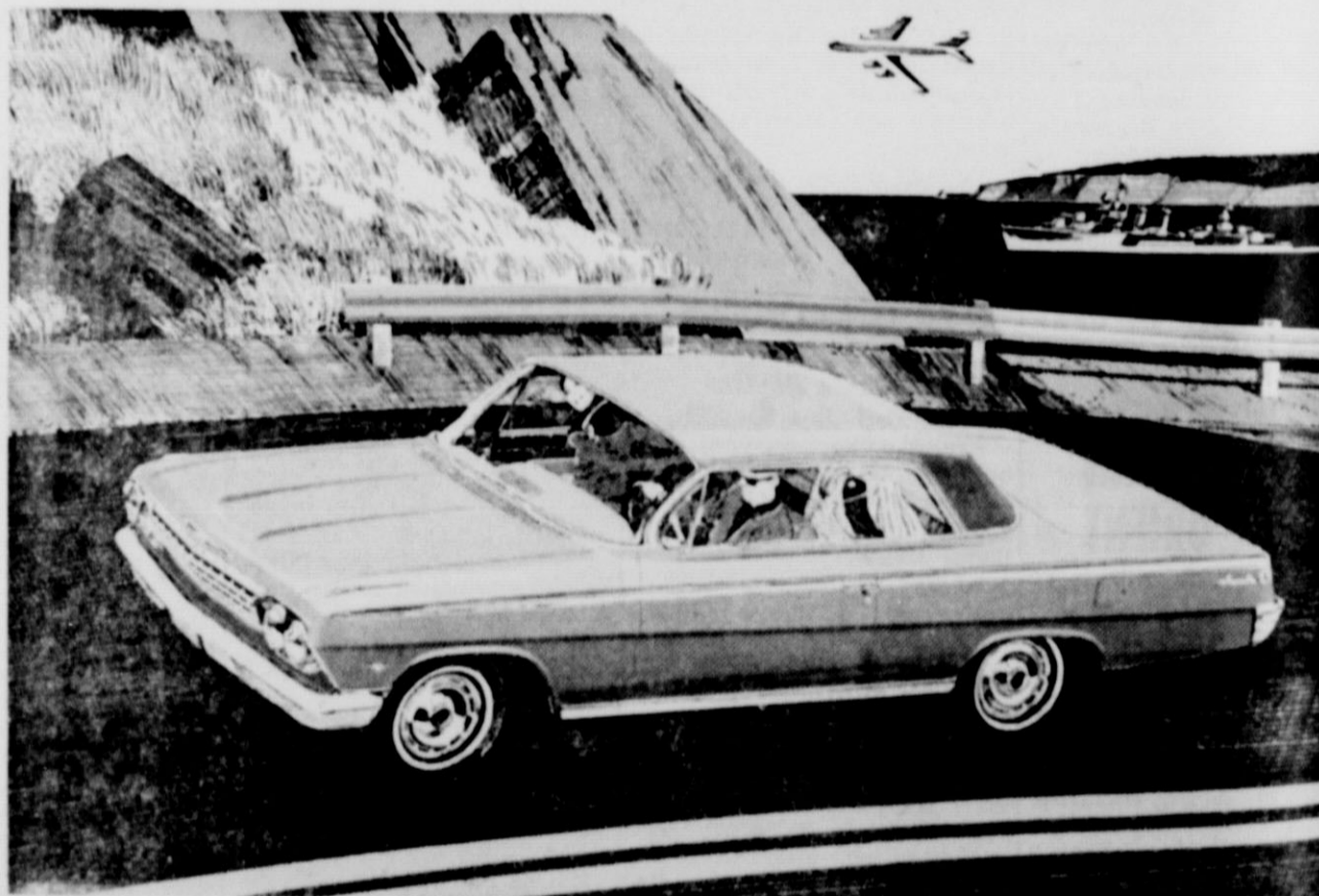
Impala Sport Coupe—here's about everything you'd expect of an expensive car—except the expense!

the car that gives you more to be happy about (right up through trade-in time)