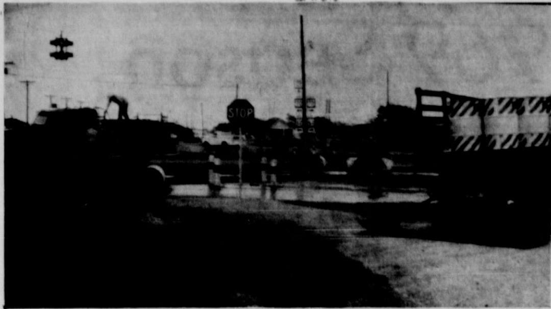
SPILLED INSECT POISON is being washed down the hill by Matador Volunteer Fire Department after an accident at the intersection of State Highway 70 and US Highway 70, Friday, August 29. The truck loaded with insecticide stopped too suddenly and tossed nine barrels into the intersection. The truck was operated by Stauffer Chemical Co. of Lubbock and the shipment was consigned to Quanah and Vernon.