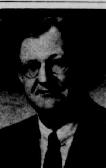
Fred C. Koch

Another advantage of the association is the wider participation through membership of families throughout the county, and thus an increased interest in the show. Another meeting will be held early in February.