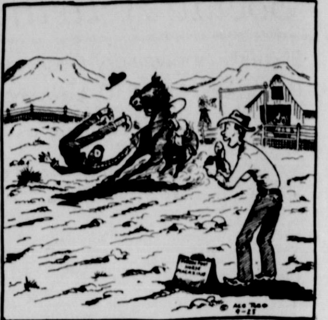
"Perfect, Mister! Our readers sure like action pictures."

This feature sponsored by THE FIRST STATE BANK