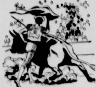
Official Publication Matador Schools